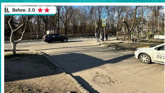
1 "Spiridon Vangheli" Primary School Nr. 21 Pedestrian Crossing, Balti, Moldova

The following are examples of school zone improvements achieving 4-5 stars through comprehensive road safety upgrades, including 30 km/h speed zones, enhanced pedestrian crossing markings, and new traffic signage.